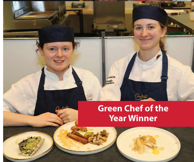
Green Chef of the Year Winner