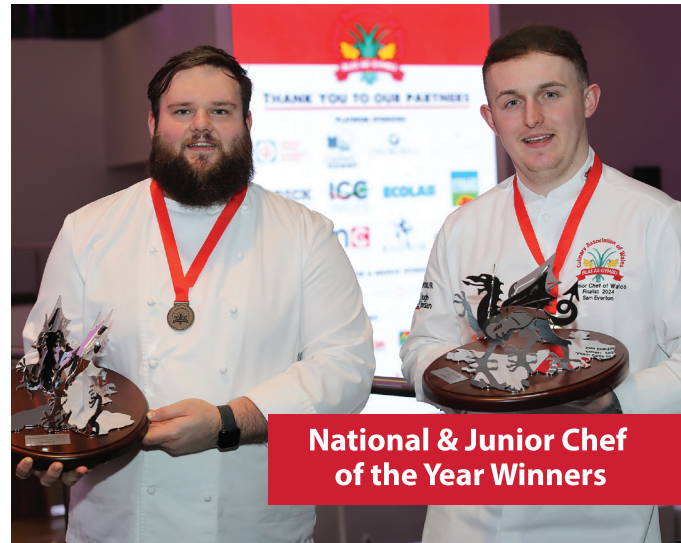
National & Junior Chef of the Year Winners

If you would like to be a sponsor, view our packages here