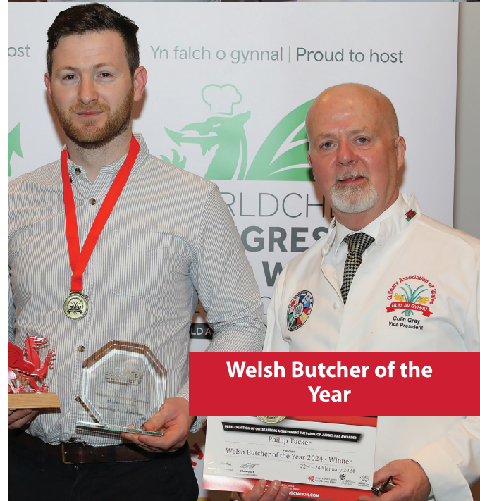
Welsh Butcher of the Year